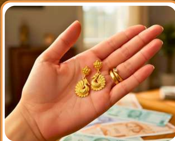
OLD GOLD DEALINGS